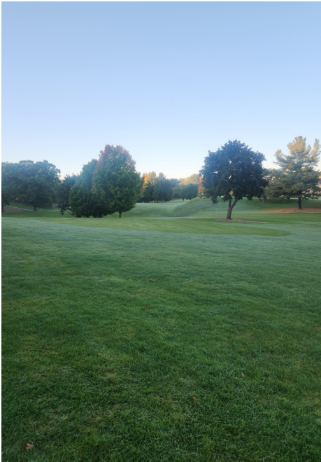
Number 8 fairway. One of the fairways that was overseeded this season.

lar fertilizers and even added humic acid, sea kelp, molasses, amino acids, iron and wetting agents.