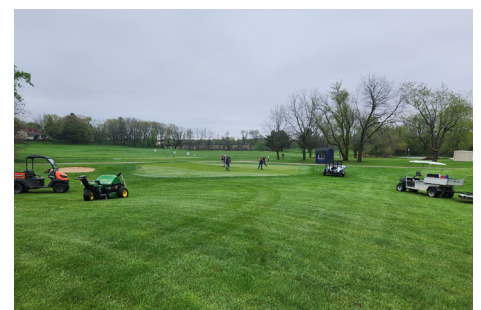
The crew Aerating the greens in the spring with some of ourw machines.

allowed to come into our stand of grass. If you have ever noticed that the back 9 fairways are tighter, dense and more playable, it is because of a variety of factors. The back 9 fairways have newer cultivars of seed and received water on a more regular basis. We invested in taking the time to aerate, spike and drill new seed into the stand on the front 9. We used low mow blue and regenerating perennial ryegrass. We fertilized with both liquid and granu-